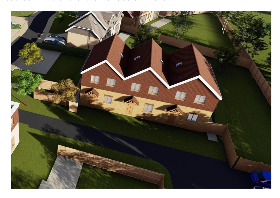
Three bedroom house on the right